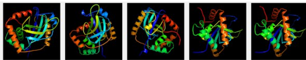
Figure 2. An example of I-TASSER result page showing tertiary structure predictions for the query proteins. The predicted models are displayed in an interactive Jmol applet, allowing the user to change the display of the molecule. The models can also be downloaded by clicking on the "Download" links. The confidence score to estimate the quality of the model is reported as C-score.